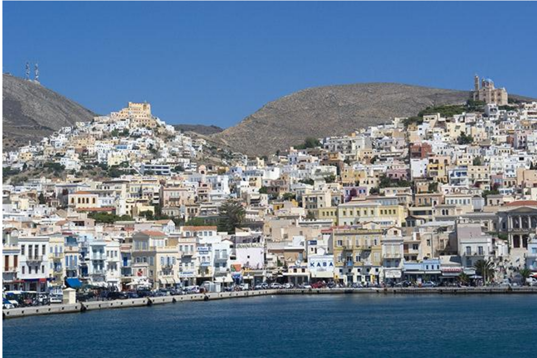
The port of Hermoupolis